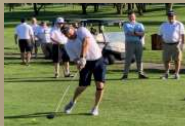
Century Club II Golf Open