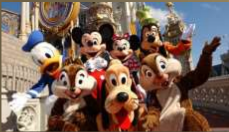
Disney World '12