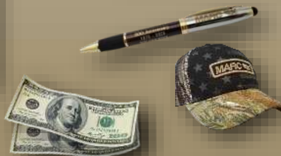
Barrier Breaker Discount