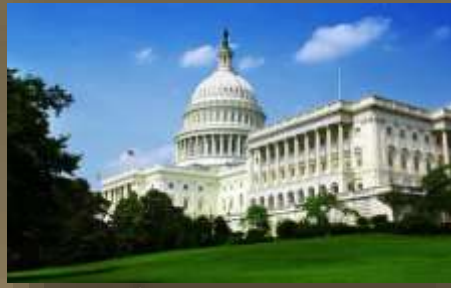
Washington DC '10