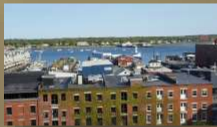
Portland, ME '17