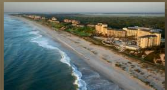
Amelia Island '22