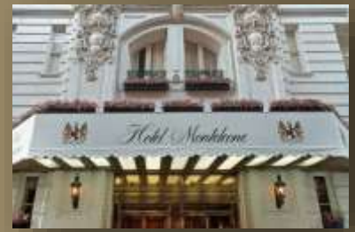
New Orleans '15