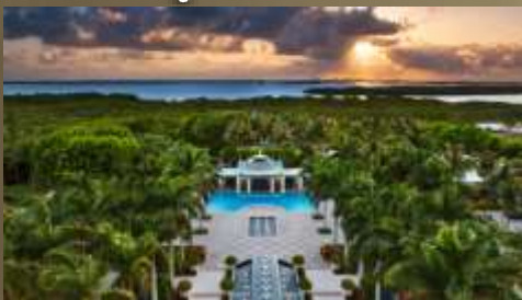
Fort Myers '16