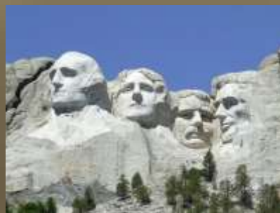
Black Hills '21