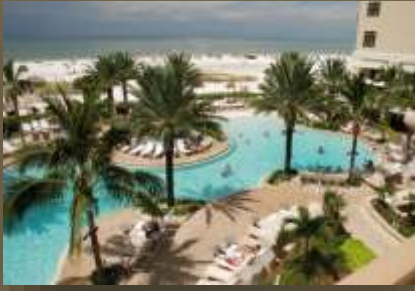
Clearwater '09, '13